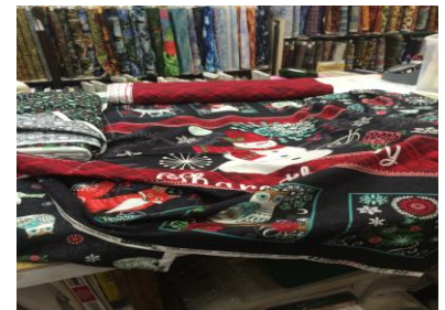
Mystery Christmas Lap Quilt

BEGINNERS - THE STARS ARE OUT TONIGHT BED RUNNER! Cost of this class is $50, pattern & templates included. You select your fabrics at your expense. This is a great project for the beginning quilter who has only done squares and half squares. In this bed runner, you will learn how to construct a star within a star. This bed runner of scrappy stars creates a dramatic effect at the end of a bed. The bed runner will measure 84" x 36" and the block size will be 24" x 24". Come join us for a couple fun afternoons & leave with this wonderful bed runner. And if you select Christmas fabrics, you me ready for Christmas. This is a 2 day class.