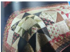
The Stars are Out Tonight Bed runner

EXPERIENCED QUILTER "INNER CITY WALL HANGING": Cost is $50, pattern & templates included. This pattern uses 2 1/2" strips. You will learn how easy "Y" seams can be to construct. This is for experienced quilters. The wall hanging is a different take on building blocks. You will learn proper rotary cutting, how to cut using a template & how to correctly mark your fabric for piecing and perfect "Y" seams. This is a 1 day class.