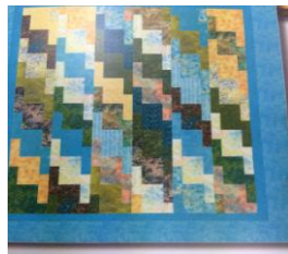
DRIPPED IN ICING