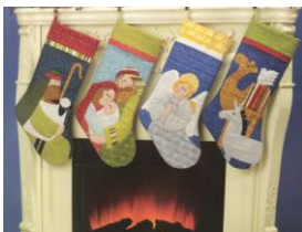
APPLIQUED STOCKINGS HANGING

ADULT BASIC SEW: 4 SESSIONS, $65 INCLUDES BOOK, SUPPLIES EXTRA. This class is designed to teach the novice or to reacquaint the reluctant sewer with basic clothing construction. Sewing projects are individually geared to each student's skills and desires. You will learn many speed tips and correct measuring techniques of the pattern and body for a more accurate fit. Come sew with us on Wednesdays.